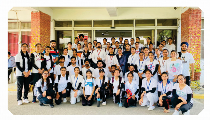
Sports Meet 2022