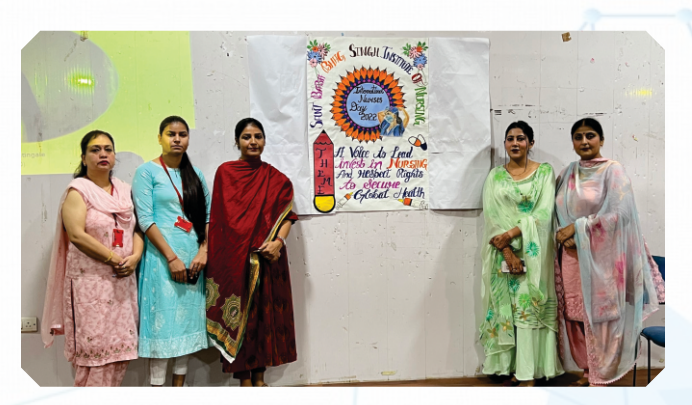
Seminar on Thalassemia