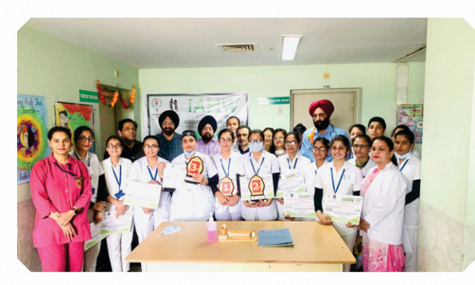
Slogan Writing Competition At Pims Hospital