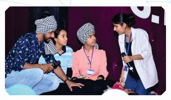
Role Play On National Mental Health Day