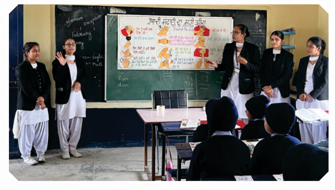
School Health Programme